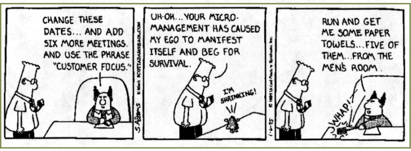
Dilbert reprinted by permission of United Feature Syndicate, Inc